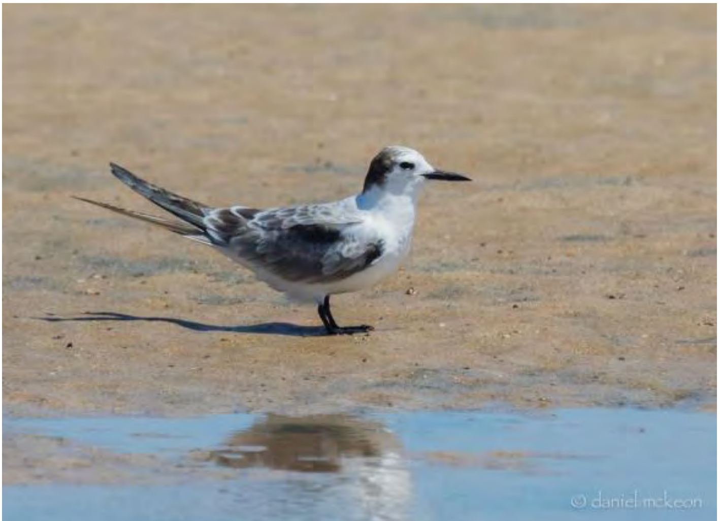
Aleutian Tern.

For references see www.mdahlem.net/birds/10/aleutern.php